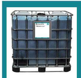
270-gallon tote SKU: SOLLCSF/NR270P UPC-12: 641238036234