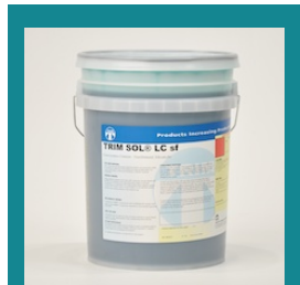
5-gallon pail SKU: SOLLCSF/5 UPC-12: 641238008668