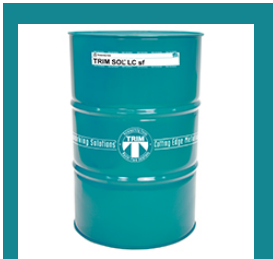
54-gallon drum SKU: SOLLCSF/54 UPC-12: 641238008675