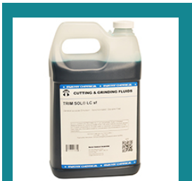
1-gallon jug SKU: SOLLCSF/1 UPC-12: 641238008651